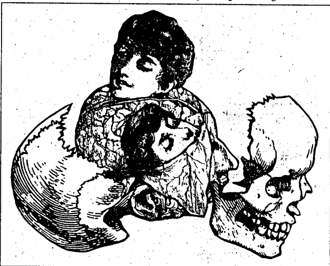
Awakenings, collage by Eric Edelman, 1990

In each human being, things are constantly shifting in their significance, as is